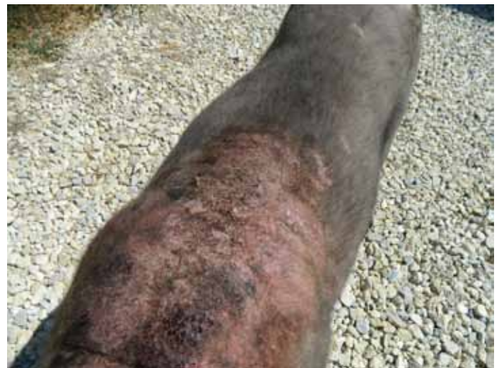
Figure 1: Alopecia with scales and crusts between the shoulders and extending caudally which developed following topical application of Certifact.