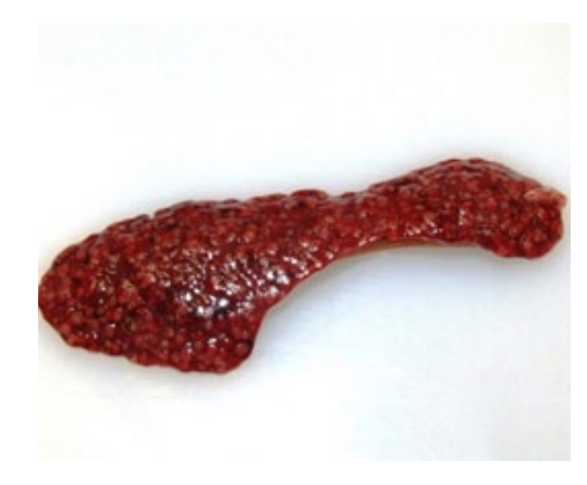
Figure 1: Spleen from cat infected with tularemia displaying multifocal to coalescing necrosis.

Antemortem diagnosis is a bit more challenging and if diagnosed early enough, the disease can be successfully treated with antimicrobial therapy. Serology tests indicate if a cat has been exposed to the disease but are more difficult to interpret than bacterial culture or IHC. There is limited information regarding