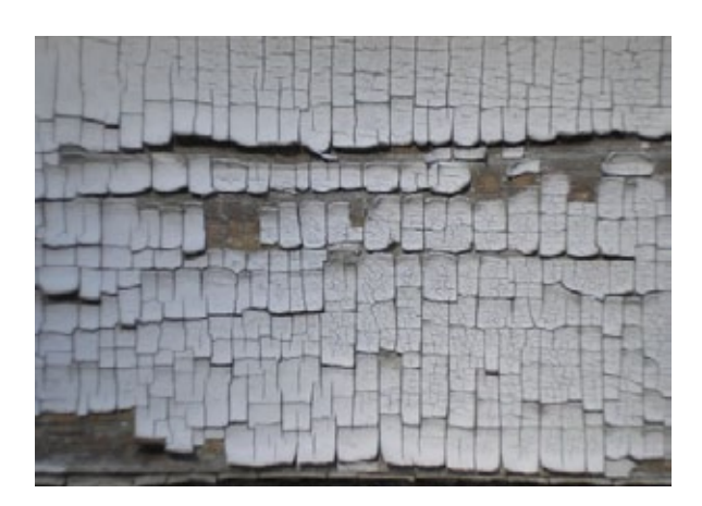
Other farm and ranch sources of lead include; grease, lead tire weights, linoleum, pipe fitting compound (pipe dope), shotgun pellets or lead bullets, lead-based painted wood, or those paint chips that have fallen off older barns or outbuildings.

In this case, the owner was unable to find any of the common sources of lead listed above, so he submitted soil samples, collected from the site of an old outbuilding which had burned down, to the KSVDL Toxicology Laboratory. These soil samples contained very high levels of lead. Lead in soil can cause toxicity by direct ingestion of the soil or by inhalation of dust from the soil. Lead poisoning in animals should be considered a sentinel for possible environmental contamination by lead which can result in toxicity for other animals or humans, particularly children.